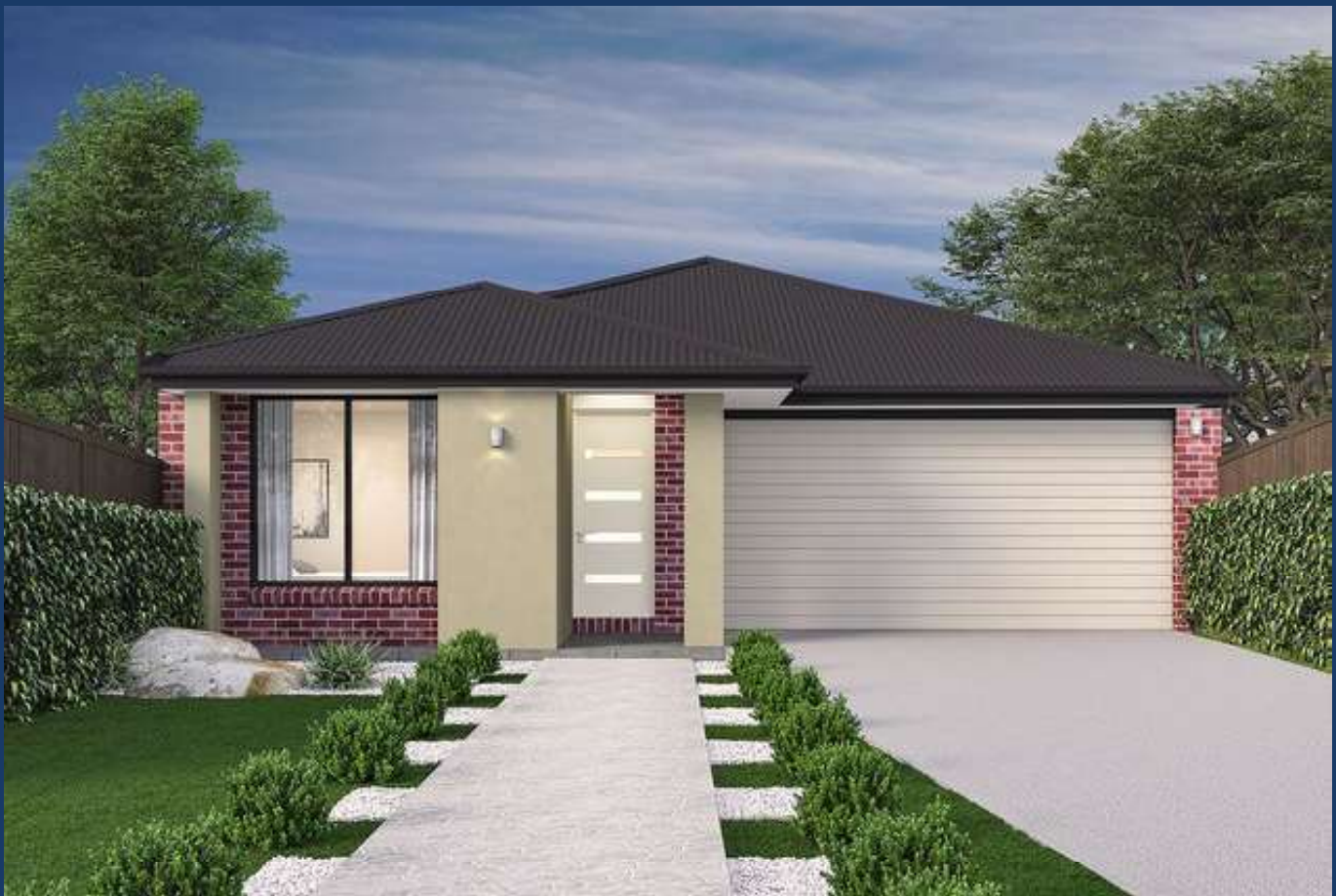
Flinders View Viewside Circuit, Drysdale Lot 121